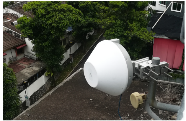
Figure 1. MetroLinq™ 2.5G 60 PTP on UCSI college rooftop

mmWave band offers unparalleled performance by combining both the benefits of unlicensed band operation with no interference. On top of that, The MetroLinq™ 2.5G 60 PTP includes a second 5GHz radio which can be configured as a backup to the 60GHz to provide automatic failover during adverse conditions. This allows links to be extended further without affecting link availability.